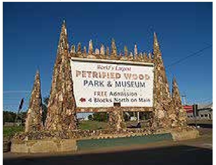
Petrified Wood Park