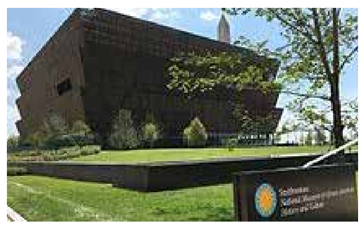
National Museum of African American History and Culture

Museum admission is free, but due to its popularity, same-day timed passes are available by visiting nmaahc.si.edu beginning at 6:30 a.m. daily. A limited number of walk-up passes will be available starting at 1 p.m. on weekdays.