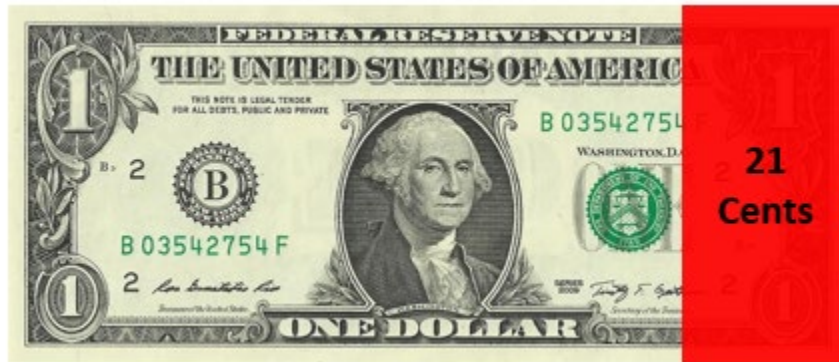
Figure 1: Rural Hospitals Could Lose 21 Cents Out of Every Dollar They Receive in Medicaid Funding